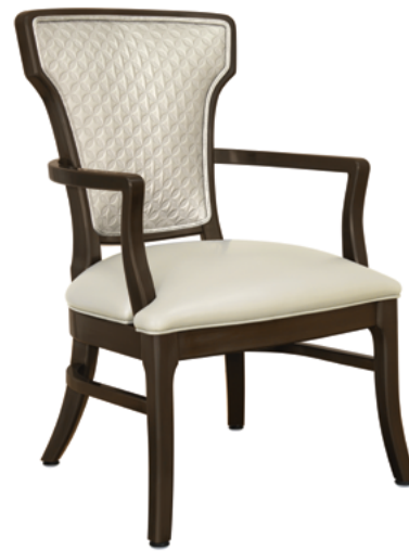
Model: MTL110 24.5W 25.5D 38H 19.25SW 19SD 19SH 26AH

Kwalu's Martello dining is where rich traditional meets transitional design. The sculpted back features broad shoulders with sleek and sophisticated contours. Meanwhile, Martello's fluid arms are engineered for easy ingress and egress. Piping adds the finishing touch to this truly elegant chair.